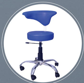
FIBER BACK STOOL