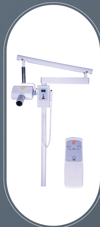
CHAIR ATTACH AC X-RAY WITH REMOTE