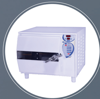
N CLASS AUTOCLAVE