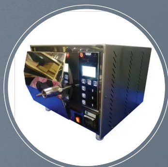
B CLASS AUTOCLAVE