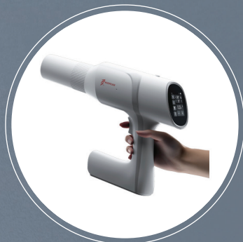
PORTABLE DC X-RAY