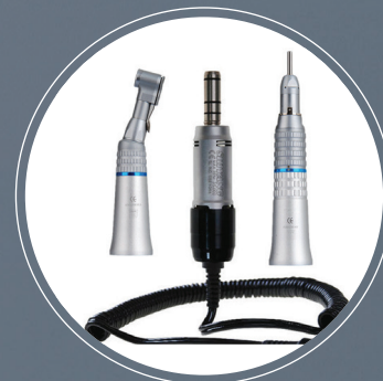
MICRO MOTOR WITH HPS